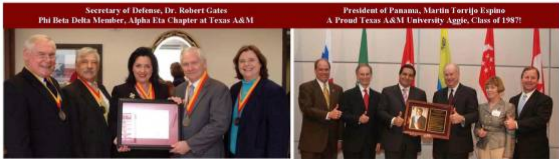
Secretary of Defense, Dr. Robert Gates Phi Beta Delta Member, Alpha Eta Chapter at Texas A&M