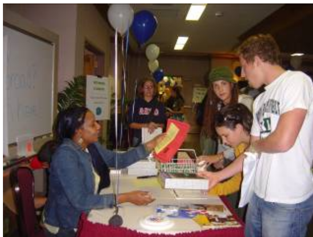
2006 Study Abroad Fair