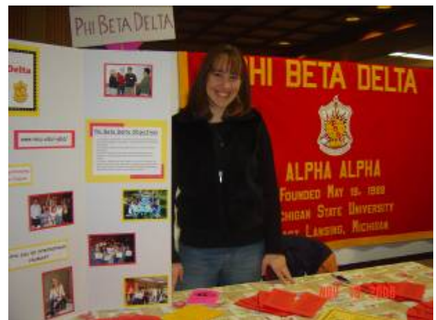
Global Festival 2006

For further information contact Dr. Charles Gliozzo ( gliozzo@msu.edu ) or check the Alpha Alpha website http://www.msu.edu/~pbd/ or the national website http://www.phibetadelta.org/