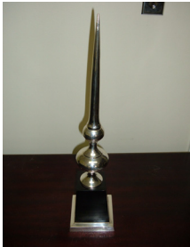
Edward S. Blankenship Award for Outstanding Staff Member

Epsilon Epsilon Chapter at Langston University