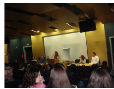
Debate on Gender Relativism