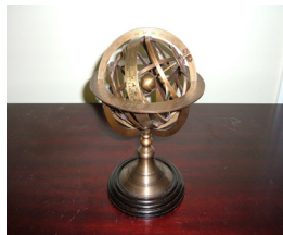
Outstanding Domestic Student Award

Omicron Chapter, California State University, Sacramento