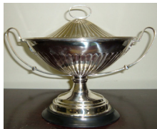
Faculty Award for Outstanding Contribu- tion to International Education

Zeta Gamma Chapter, Northern Illinois University