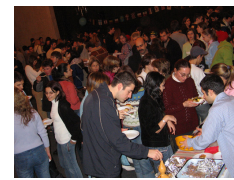
AUBG Food Festival