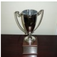
David Merchant International Student Award