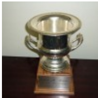
Eileen Evans Outstanding Chapter Award