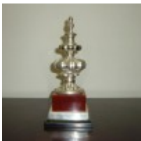
The Executive Director Cadastre

Chapters may submit two student nominations—one for a domestic student and one for a student from outside of the United States; however, only one nomination may be submitted for the staff and faculty awards. Nomination materials for unsuccessful nominees for the faculty and staff awards will be retained for consideration for awards in the subsequent year with the permission of the nominator. Award recipients are expected to attend the awards ceremony held during the International Conference, where the presentations will be made. Each chapter will be provided with a Nomination Cover Form which should be duplicated for each nomination submitted. Award information and Nomination Cover Form, as well as a list of previous recipients, are included on the Phi Beta Delta web site: http://www.phibetadelta.org/index.php/awards/past-recipients.html