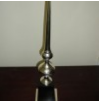
Edward Blankenship Staff Award