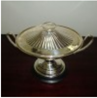
Yvonne Captain Faculty Award