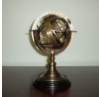
Domestic Student Award