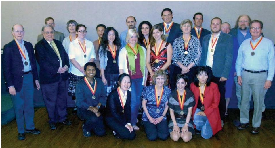
Attendees at the annual banquet of the Omicron Chapter of Phi Beta Delta, California State University, Sacramento (including the 2010 initiates)