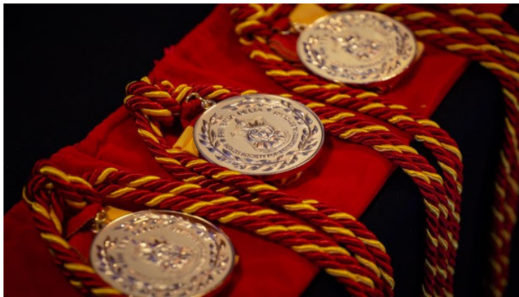
Delta San Diego State University