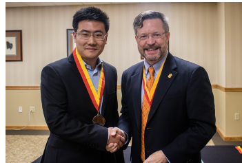
Eta Lambda College of Staten Island/ The City University of New York