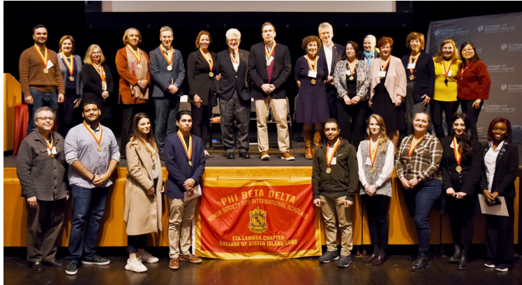
Eta Lambda Chapter celebrated their induction in Spring 2023 [us18.mailchimp.com]