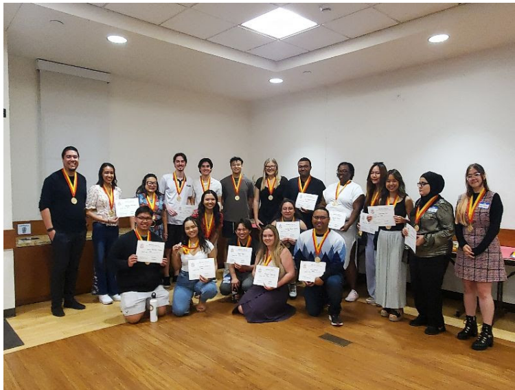
Delta Chapter at San Diego State University celebrates their induction.