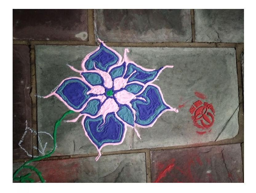
Beta Xi Lamar University

Diwali/Tihar festivities symbolize to people that good can triumph over evil. It is a time of togetherness and goodwill with the ageless message, no matter how challenging life might be, the good will win in the end. The festival is a good opportunity for attendees to learn about Hindu cultural practices.