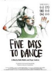
Five Days to Dance