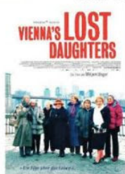
Vienna's Lost Daughters