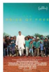
The Price of Free